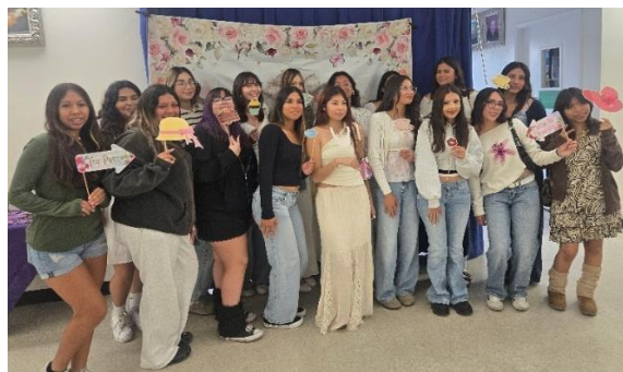
Young ladies at St. John of the Cross Confirmation class