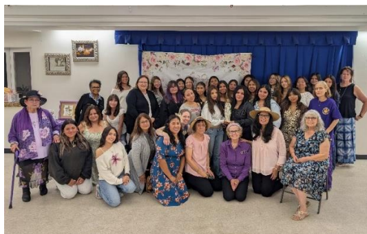
Ct. Teresa of Avila #1580 members