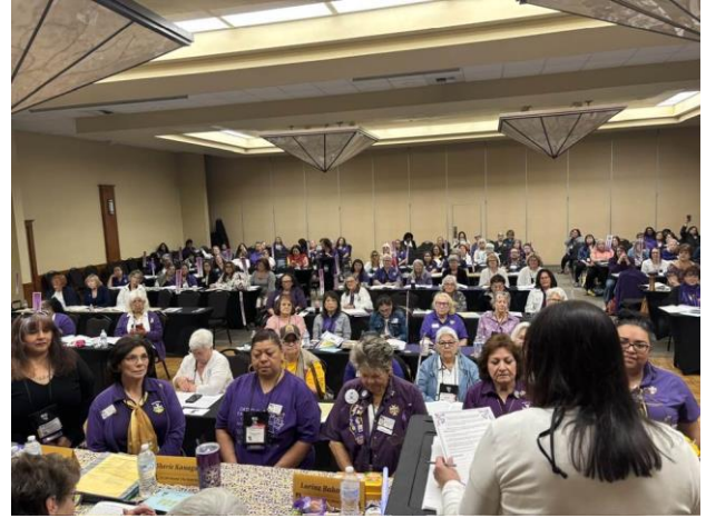
2027 Nominating Committee