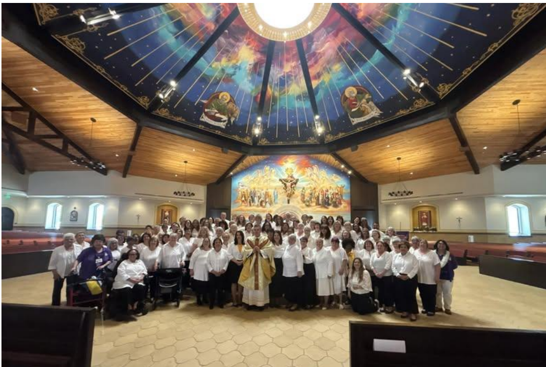
Thursday, April 24, 2025 the Opening Mass at St. Charles Borromeo Catholic Church in Visalia, CA