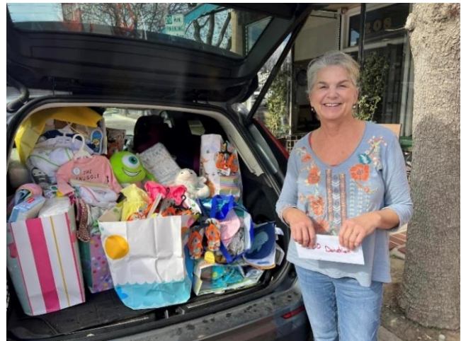
Representative from the Crossroads Pregnancy Center receiving gifts.