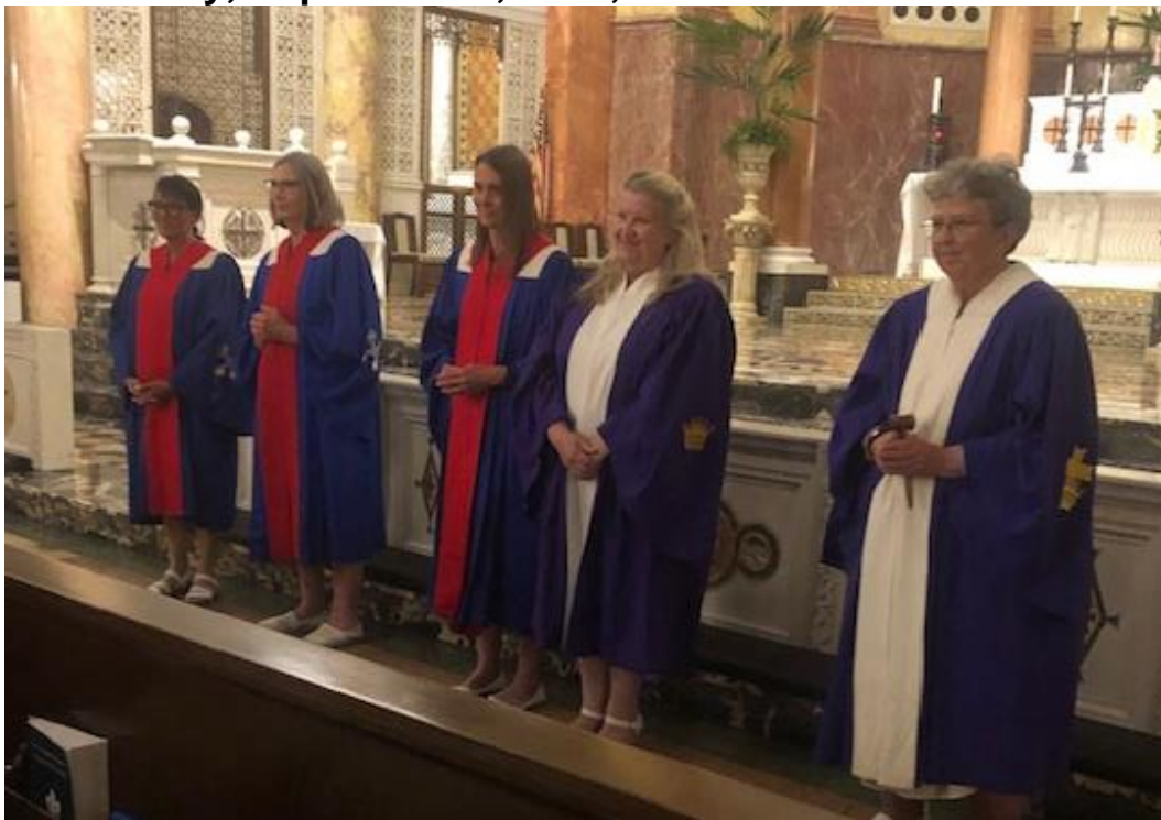
Court st. Andrews #2792 Officers

On Friday, September 8, 2023, CA CDA instituted a new court: